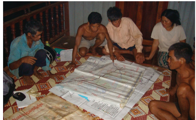
Presentation of village map

Change is not necessarily a linear process and the short-term benefits of mapping may not be immediately clear. However, the literature suggests that mapping can have long term benefits for tenure security. Thus for example early attempts at mapping indigenous lands in Canada showed poor results for almost 20 years. However, as the political and legal environment changed old