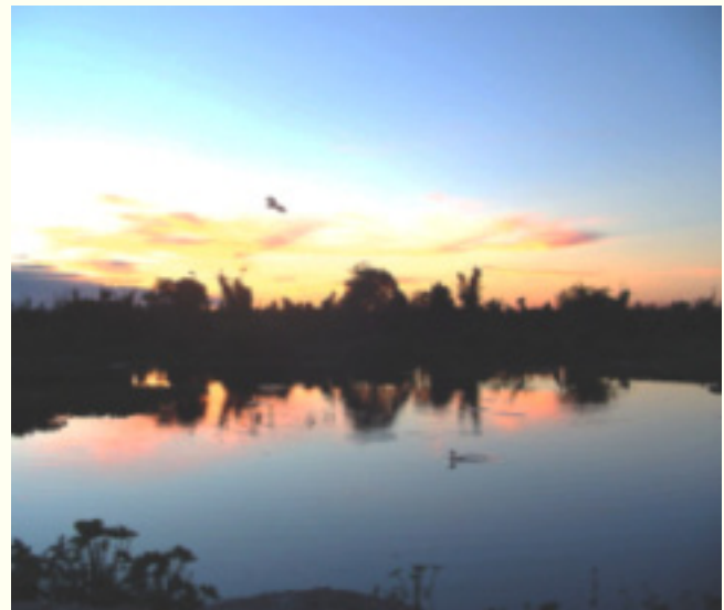
In this Amazon setting, the Tikuna peoples are rediscovering themselves through tourism.